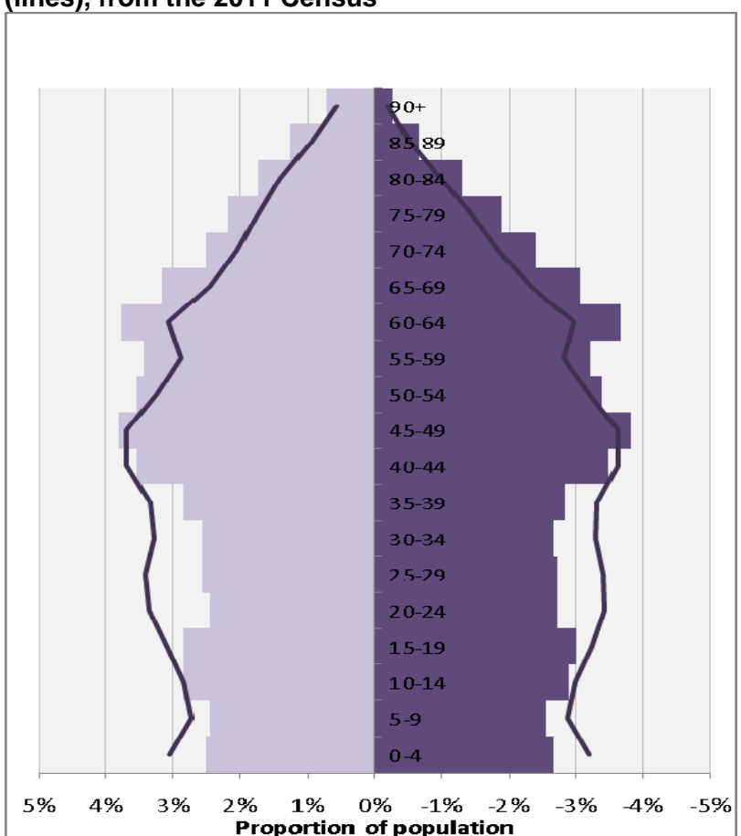
Figure 2.3. Age structure of Herefordshire (bars) and England and Wales (lines), from the 2011 Census<sup>8</sup>

Like the national population structure, Herefordshire's population is ageing with one in five people aged 65 or over (compared to one in six nationally)<sup>7</sup>. Figure 2.3 shows how much older the age structure of Herefordshire is compared to England and Wales, with higher proportions of residents in all age groups from 45-49 upwards and less in the middle aged groups. Both national and local forecasts predict a further rise in the proportion of older people and thus a need to plan for the consequence of an ageing population, for example by providing for supported and extra care housing, and ensuring better access to health care and community facilities.