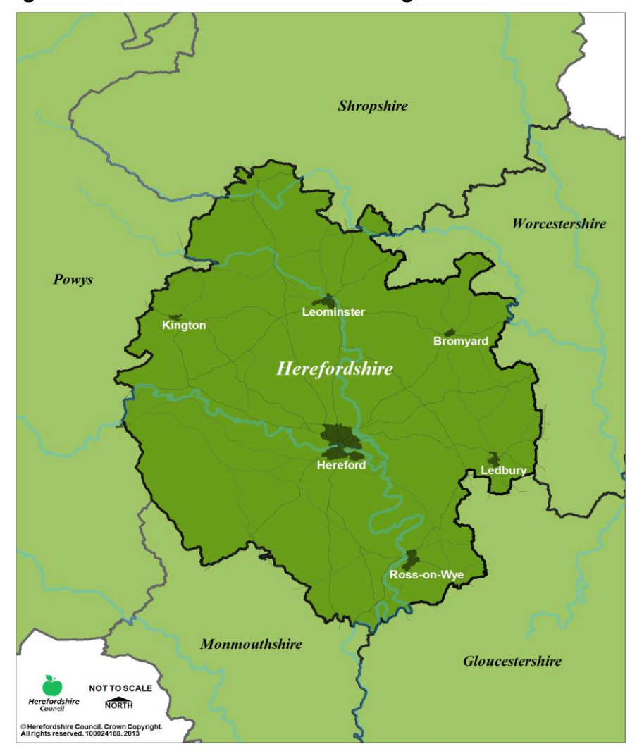
Figure 2.1 Herefordshire and surrounding counties

Herefordshire is a large, predominately rural, landlocked county situated in the south western corner of the West Midlands region, on the border with Wales. It has a close relationship with neighbouring Shropshire and Worcestershire and there are a range of interactions taking place which cross Herefordshire's boundaries in all directions, including service provision, transport links and commuting patterns.